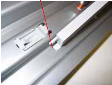
Position with slot toward front