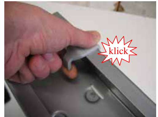
Snap down to lock in place