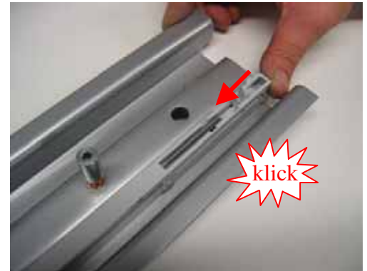
Slide into place to fix