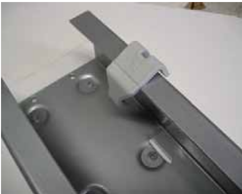
Position at punched-out notch at rear of bottom slide