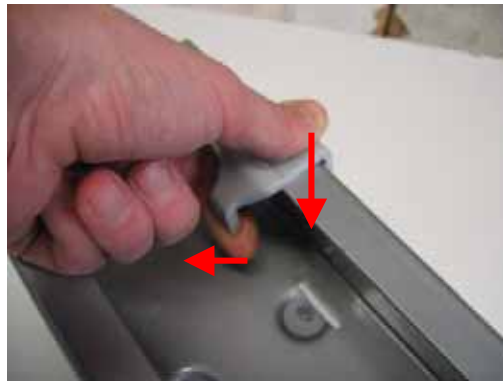
Pull toward center and push down