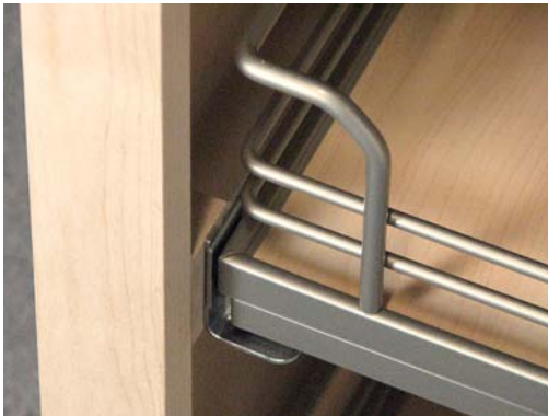
3. Fixing position »inset«