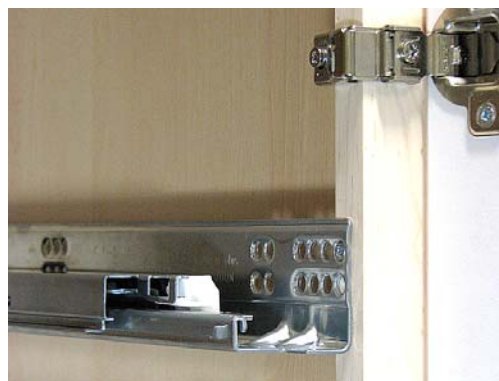
3. Fixing position »overlay«