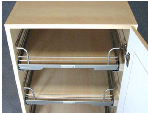
2. Fixing position »frameless«