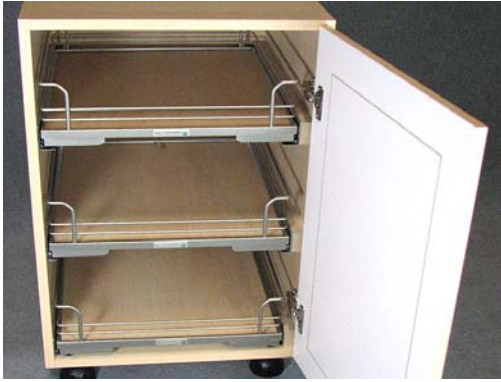
1. Face frame »inset«