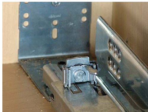
4. Back connection for Blum-runner