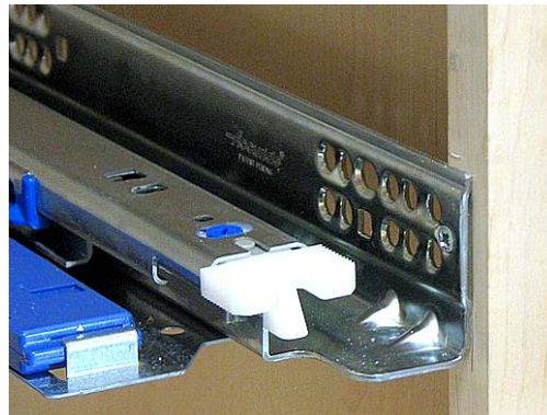
2. Fixing position »overlay«