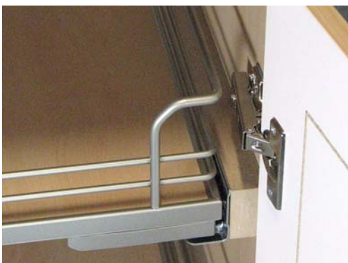
3. Fixing position »frameless«