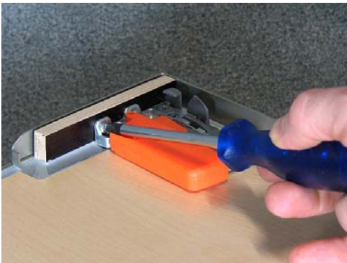
1. Screw the connection to the adapter (to required position – like a drawer)