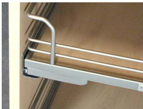
4. Fixing position »frameless«