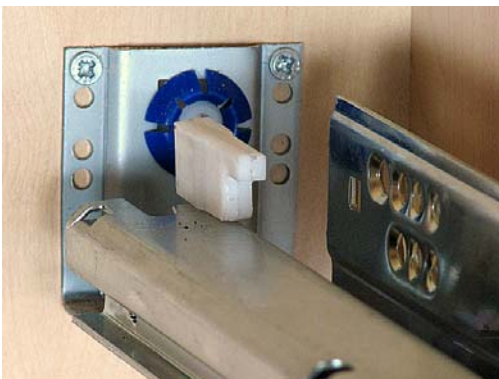
3. Back connection for Accuride-runner (incl. Adapter)