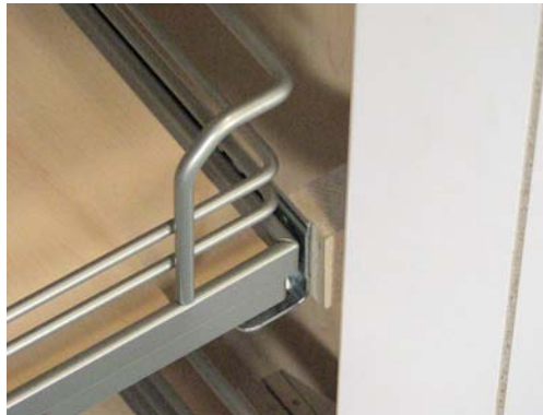
4. Fixing position »inset«