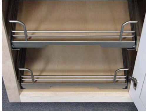
2. Fixing position »inset«